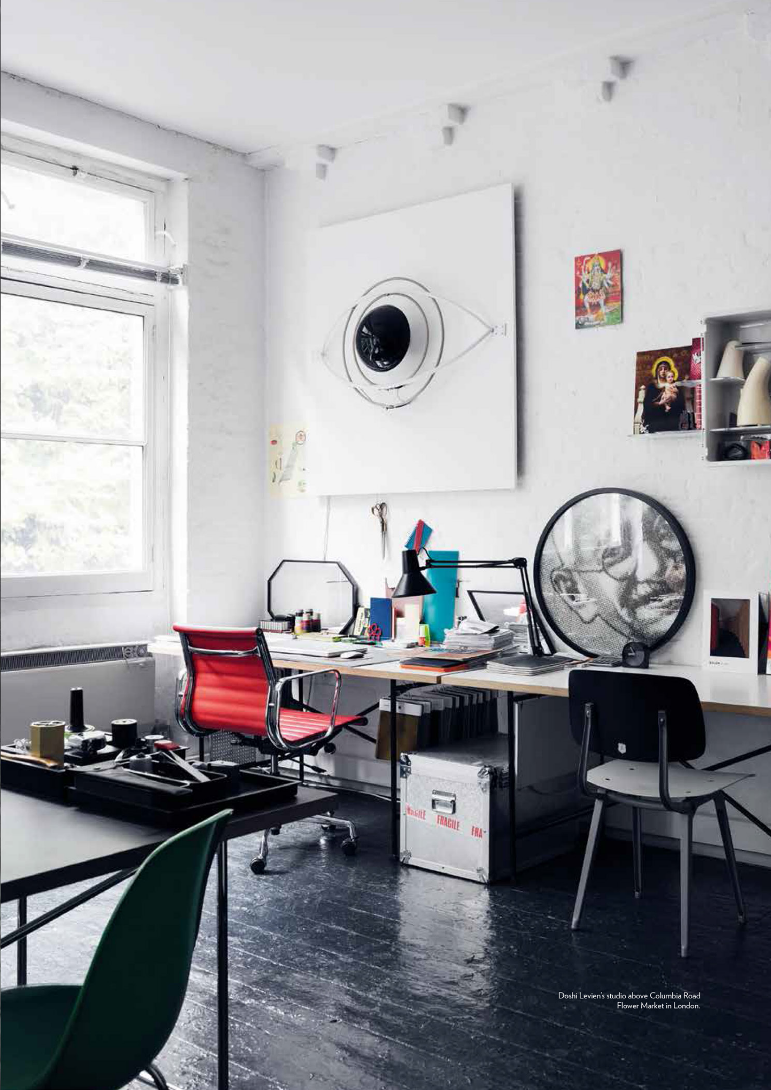
Doshi Levien's studio above Columbia Road Flower Market in London.