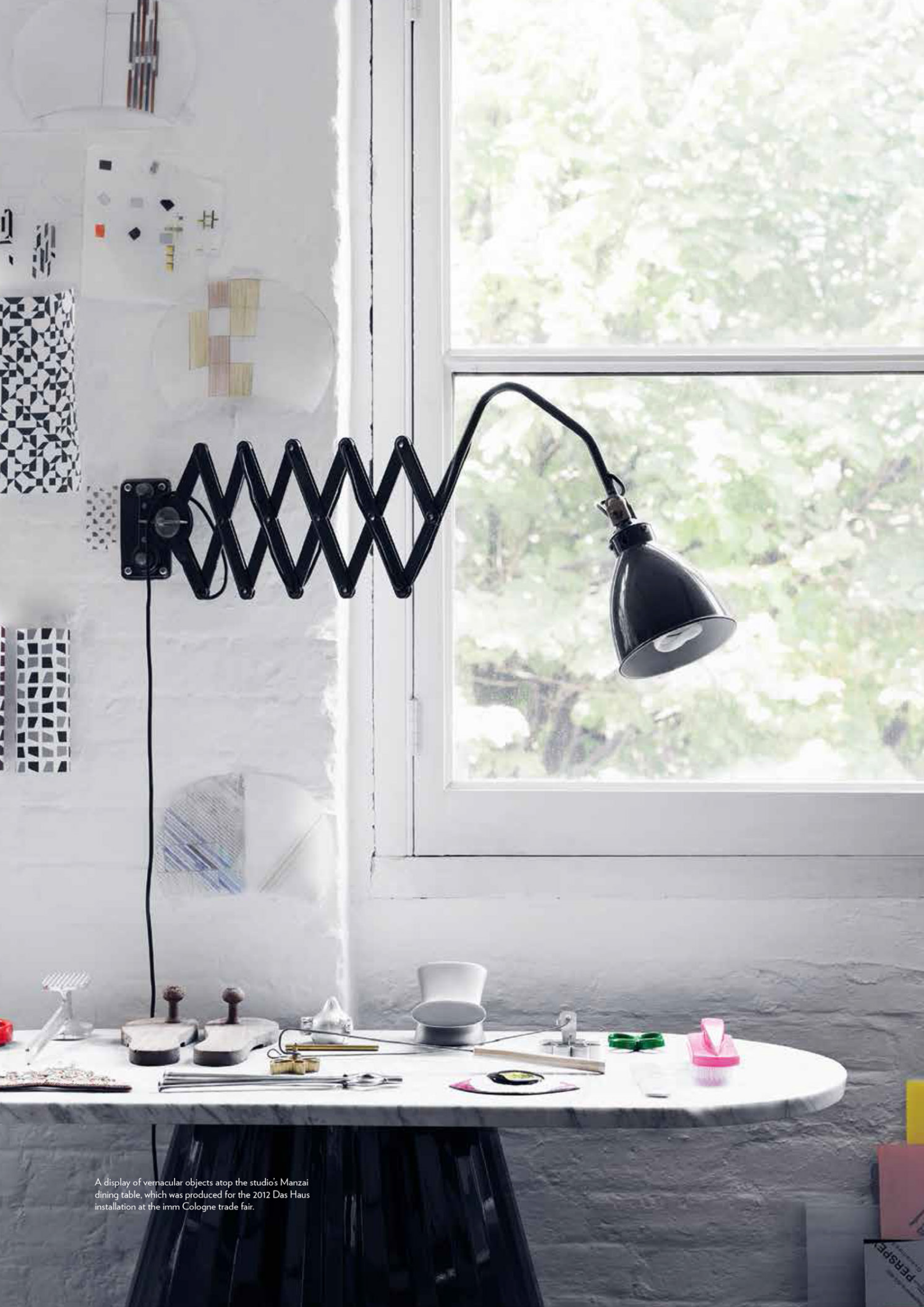
A display of vernacular objects atop the studio's Manzai dining table, which was produced for the 2012 Das Haus installation at the imm Cologne trade fair.